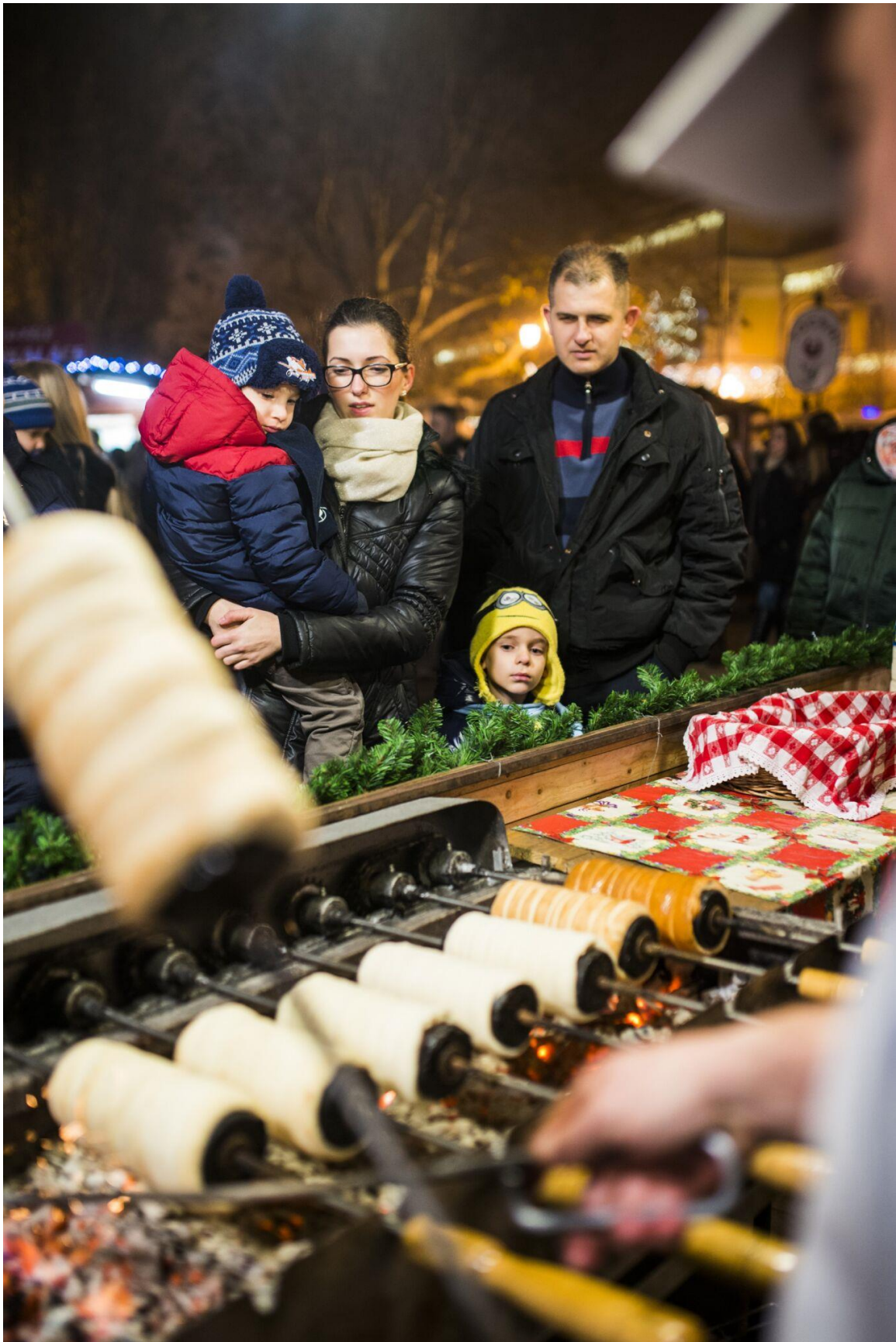
Advent Fair (Kossuth Square, Nyíregyháza)