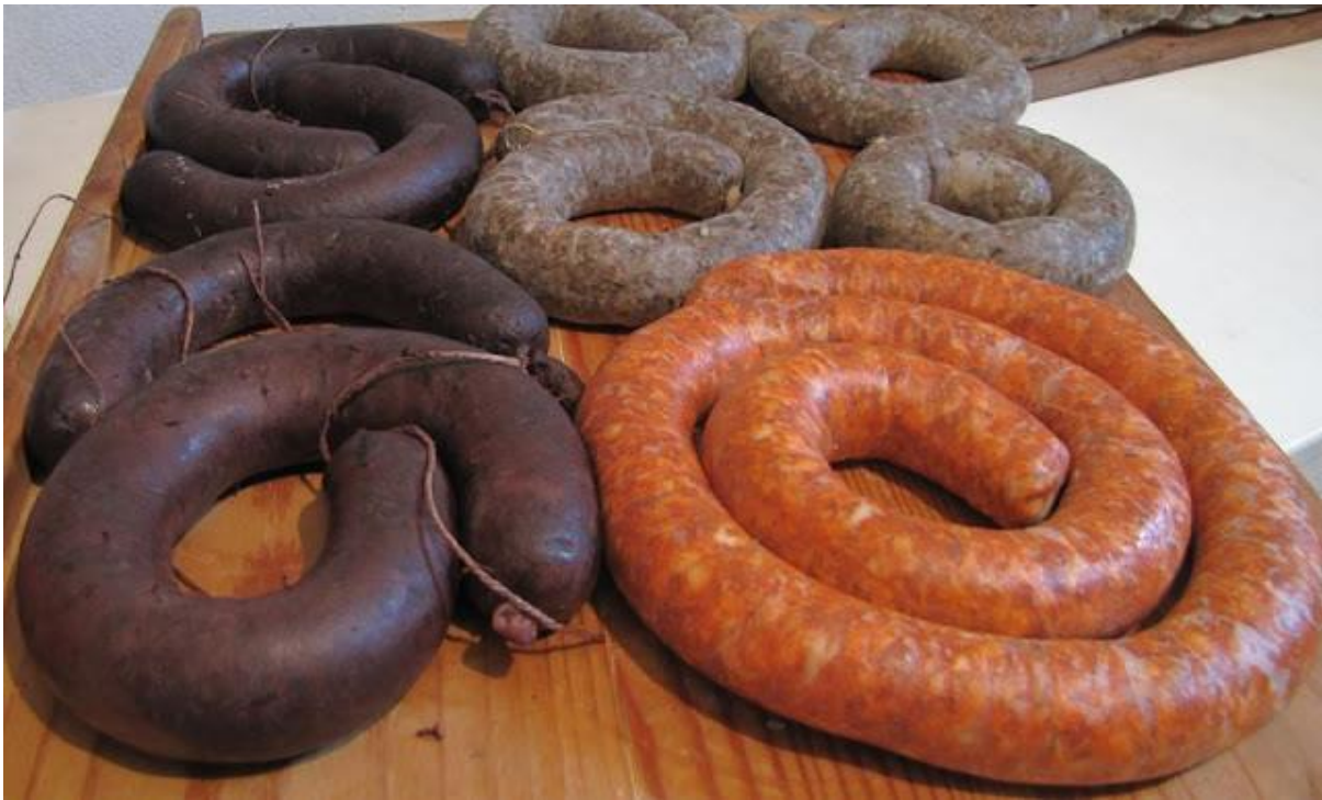
Freshly baked sausages, blood sausages and liver sausages