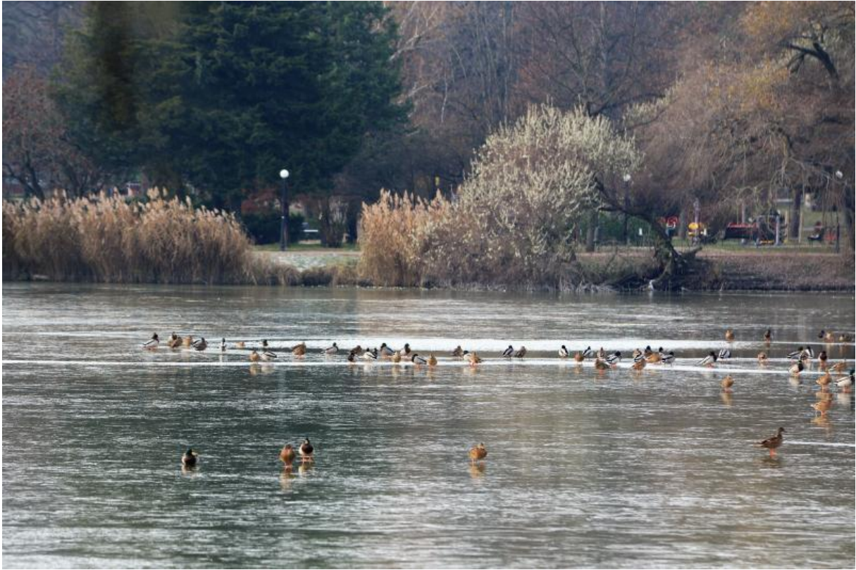
Sóstó in the winter, 2020