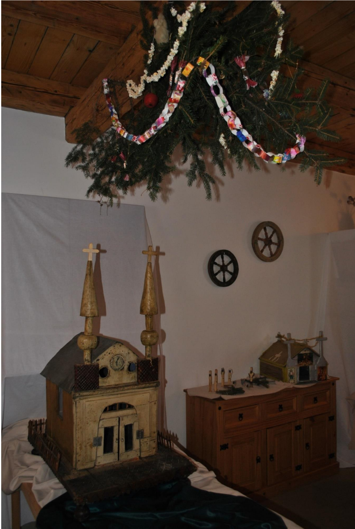
Nativity crib and above an evergreen bough, Sóstó Open Air Museum 2014 (Sóstó-Nyíregyháza)