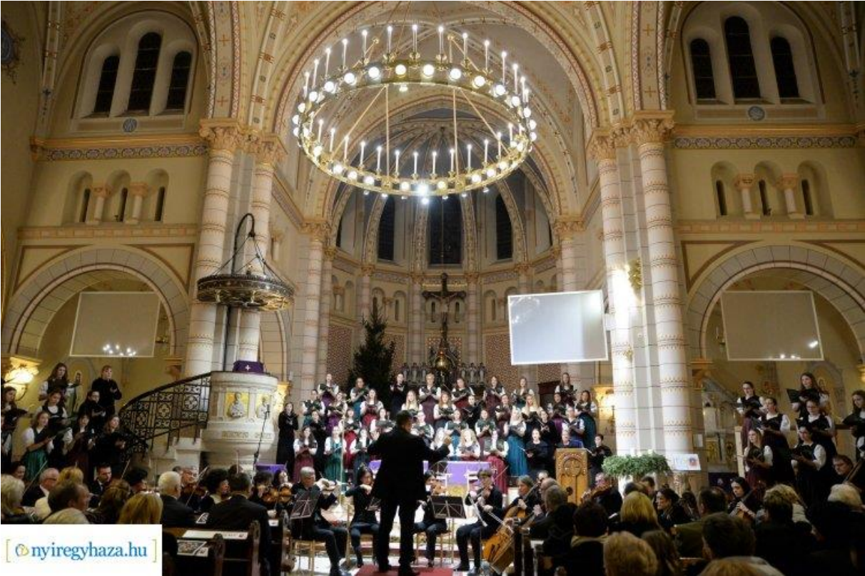
Christmas concert of the City in the Roman Catholic Joint-Cathedral