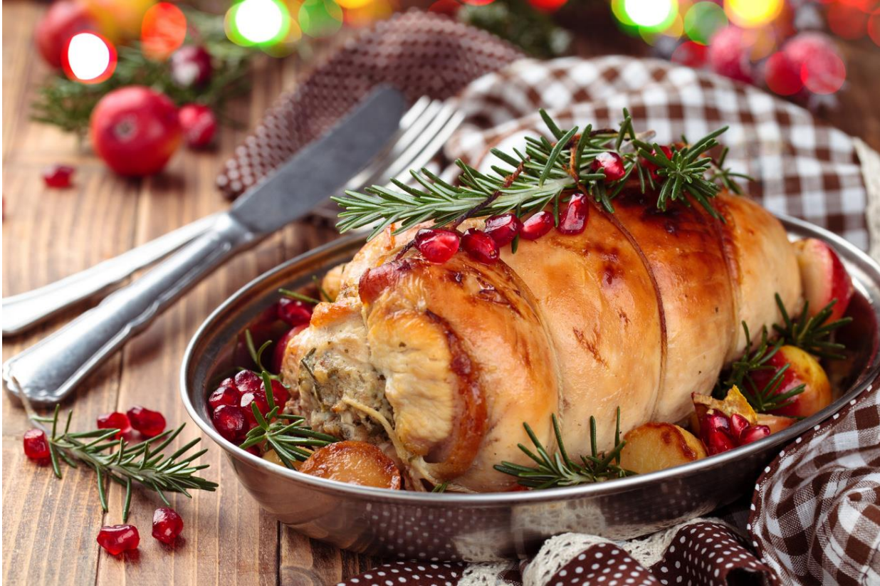
Turkey breast with chestnut filling