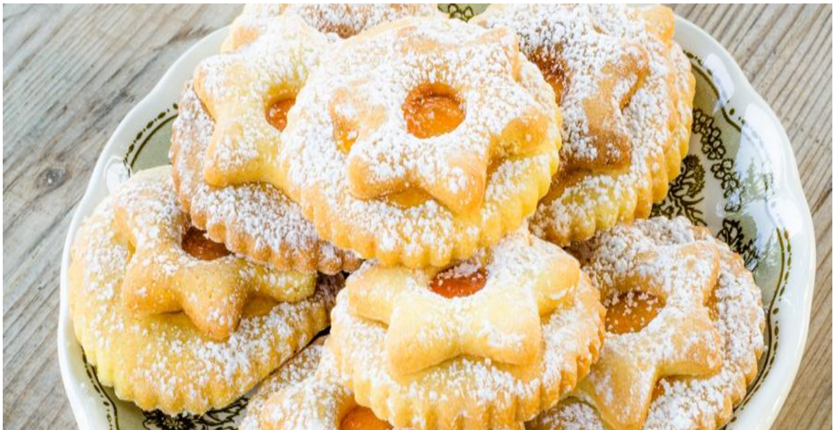
Jam-filled shortbread cookies