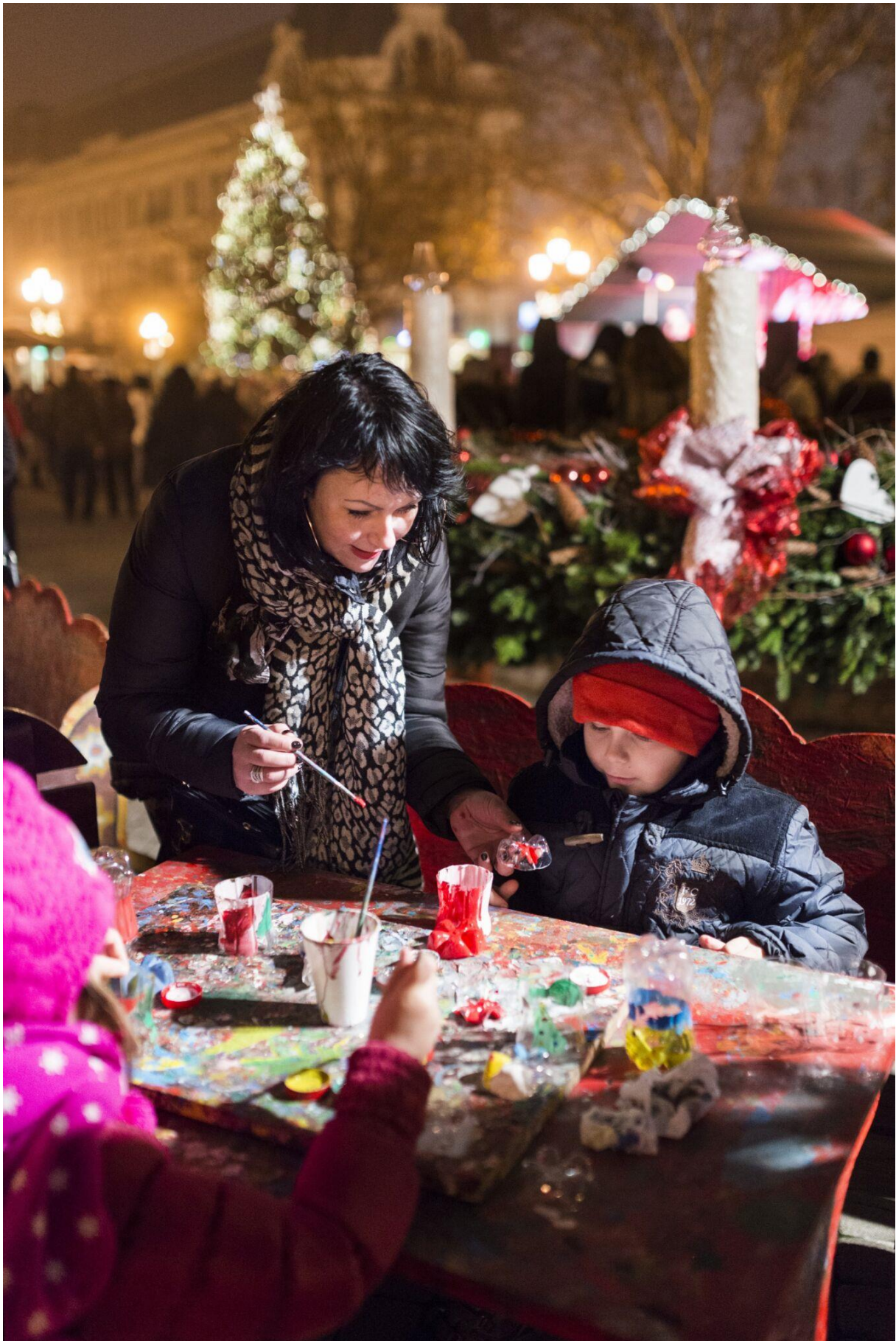
Christmas craft class – Advent Fair (Kossuth Square, Nyíregyháza)