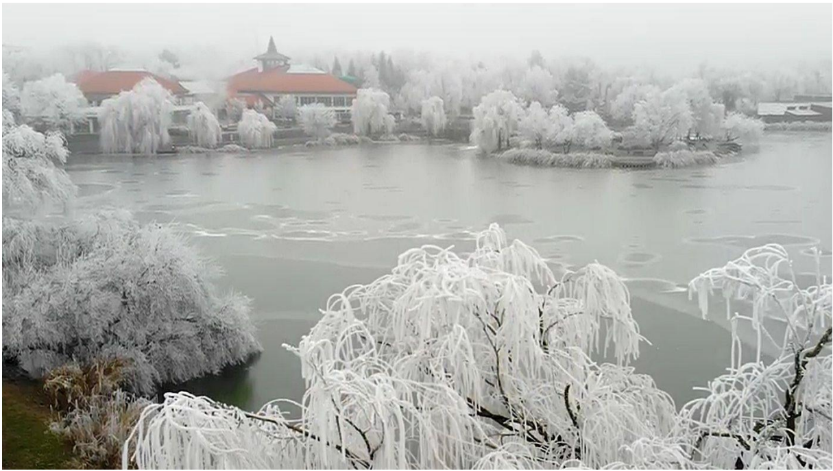
Sóstó in the winter