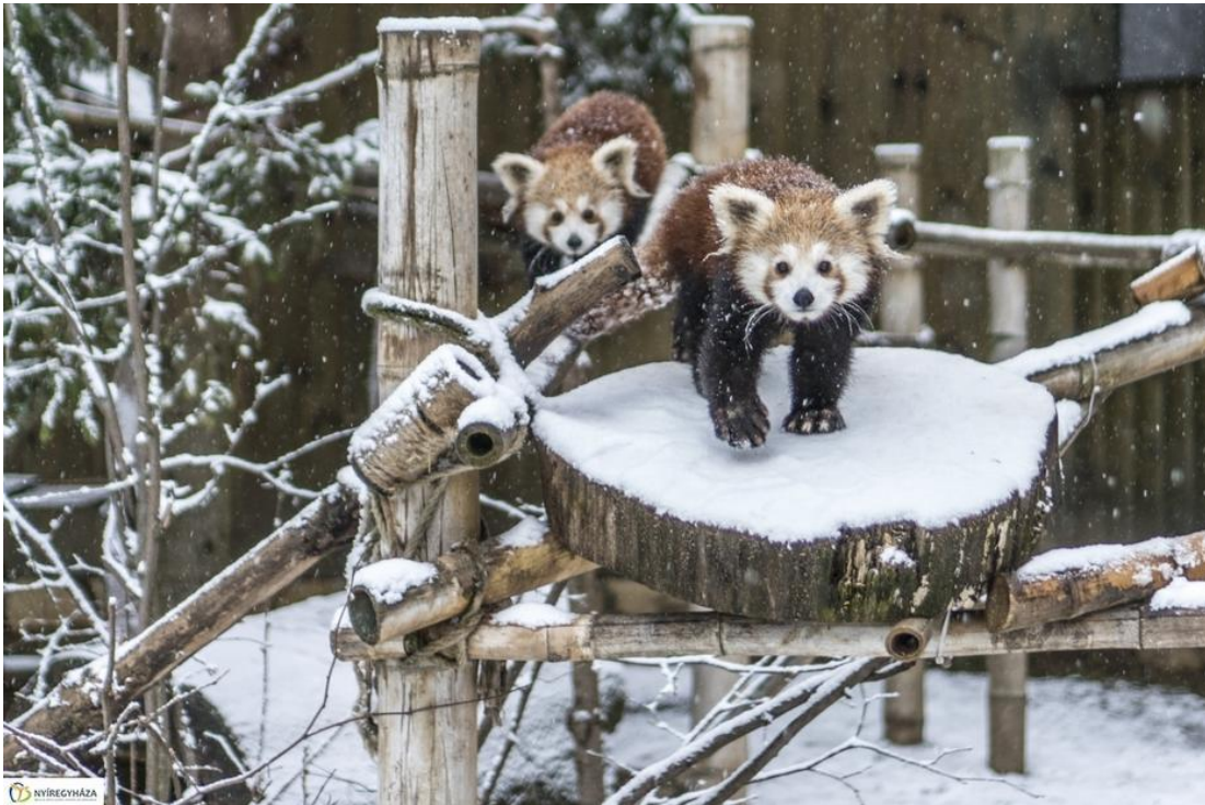
Zoo - Sóstó