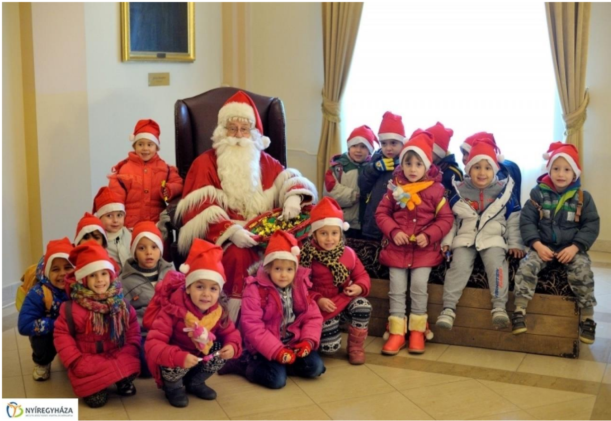
The children meet Santa Claus at the City Hall