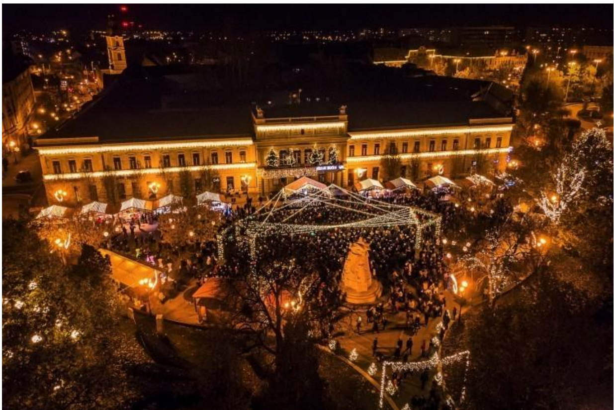
Kossuth Square, 2019