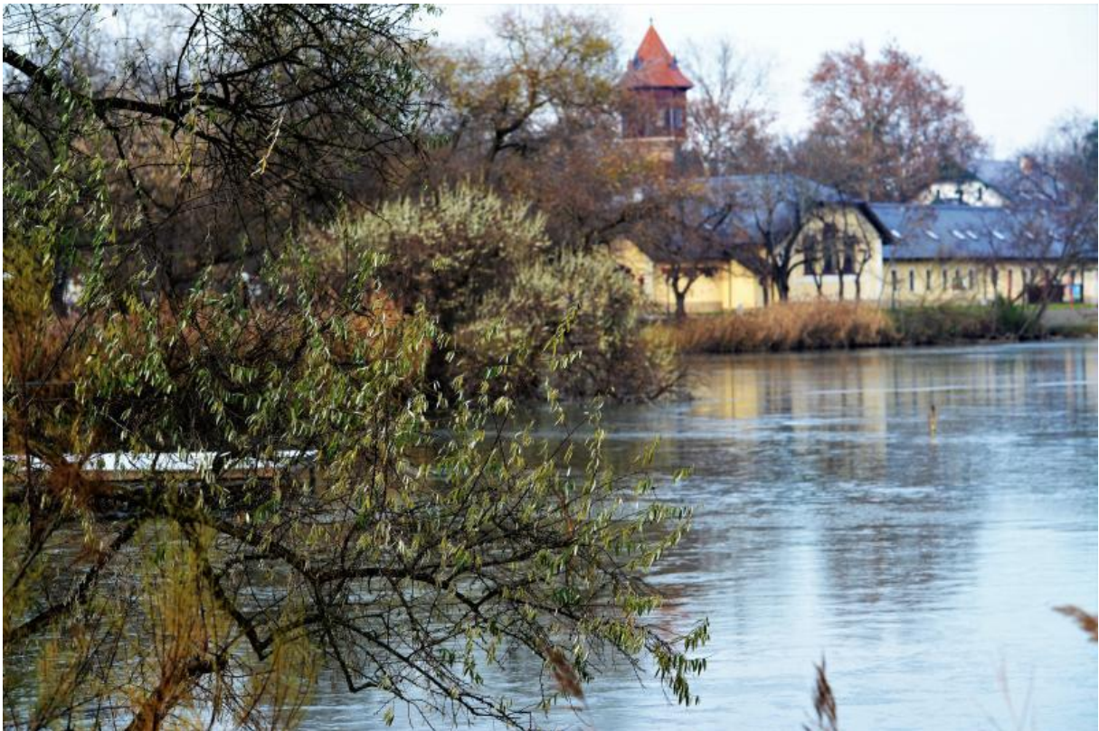
Sóstó in the winter, 2020