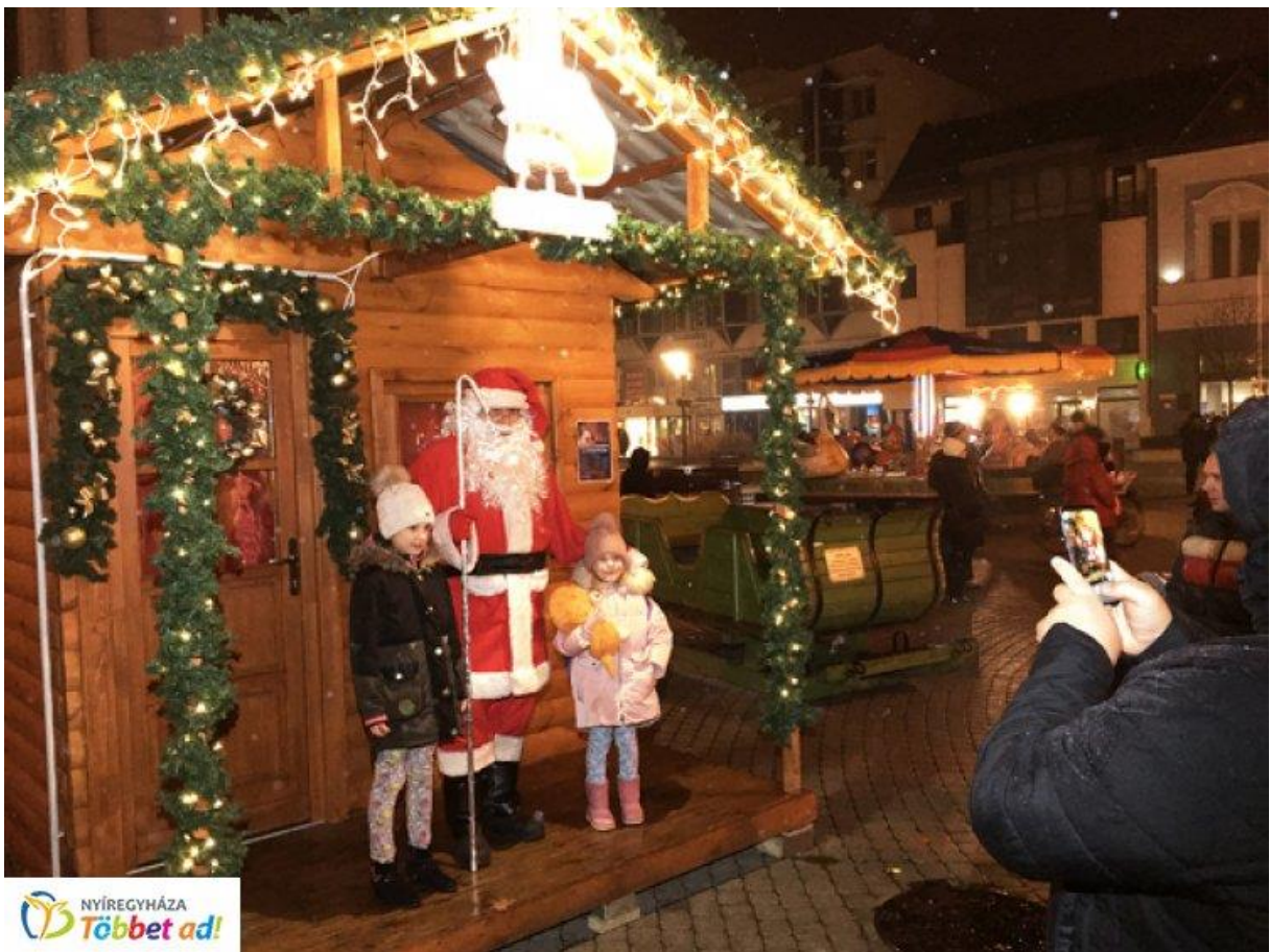
Santa Claus House (Kossuth Square, Nyíregyháza)