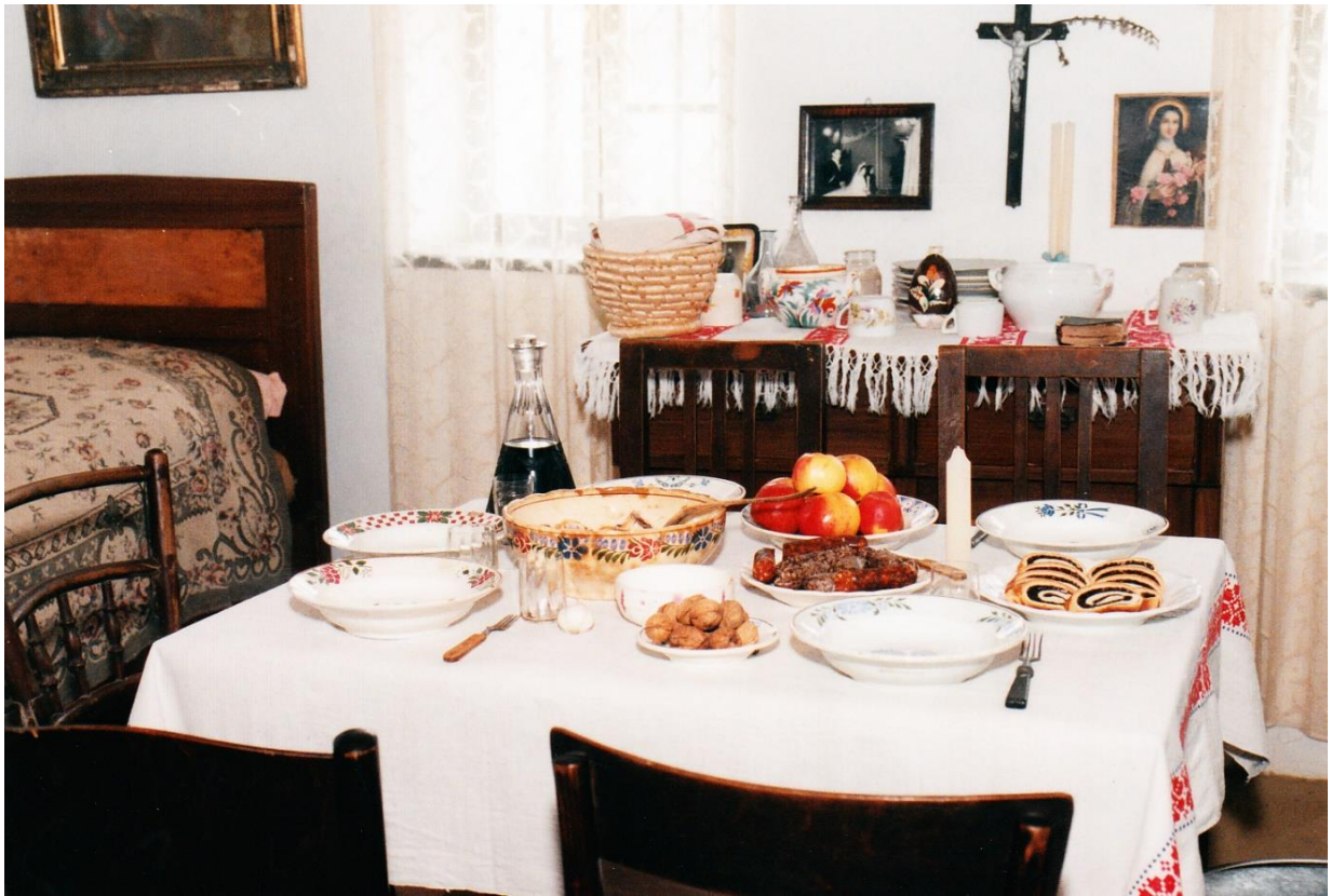
Set table with traditional Christmas dishes, 1997 (Sóstó Open Air Museum, Sóstó- Nyíregyháza)