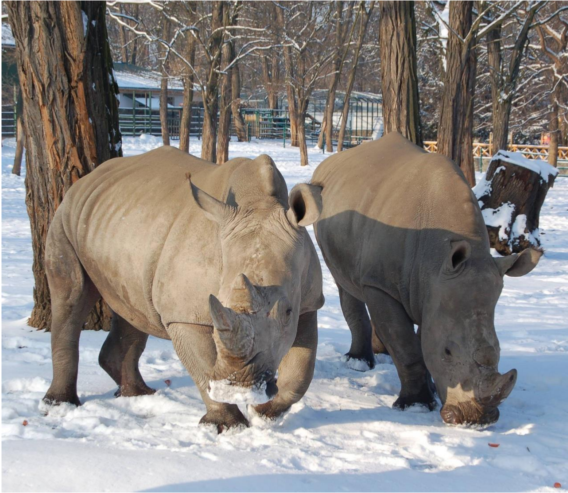
Zoo - Sóstó