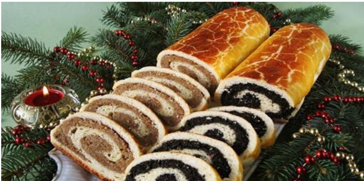
Poppy seed roll and walnut roll