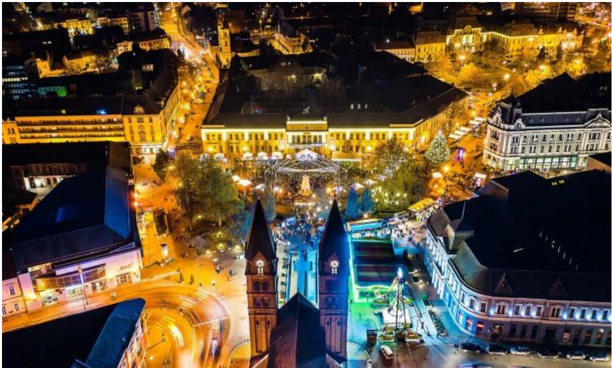
City center - drone photography: Árpád Kohut