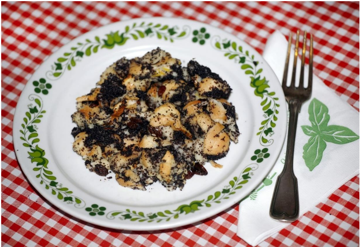
Poppy seed bread pudding