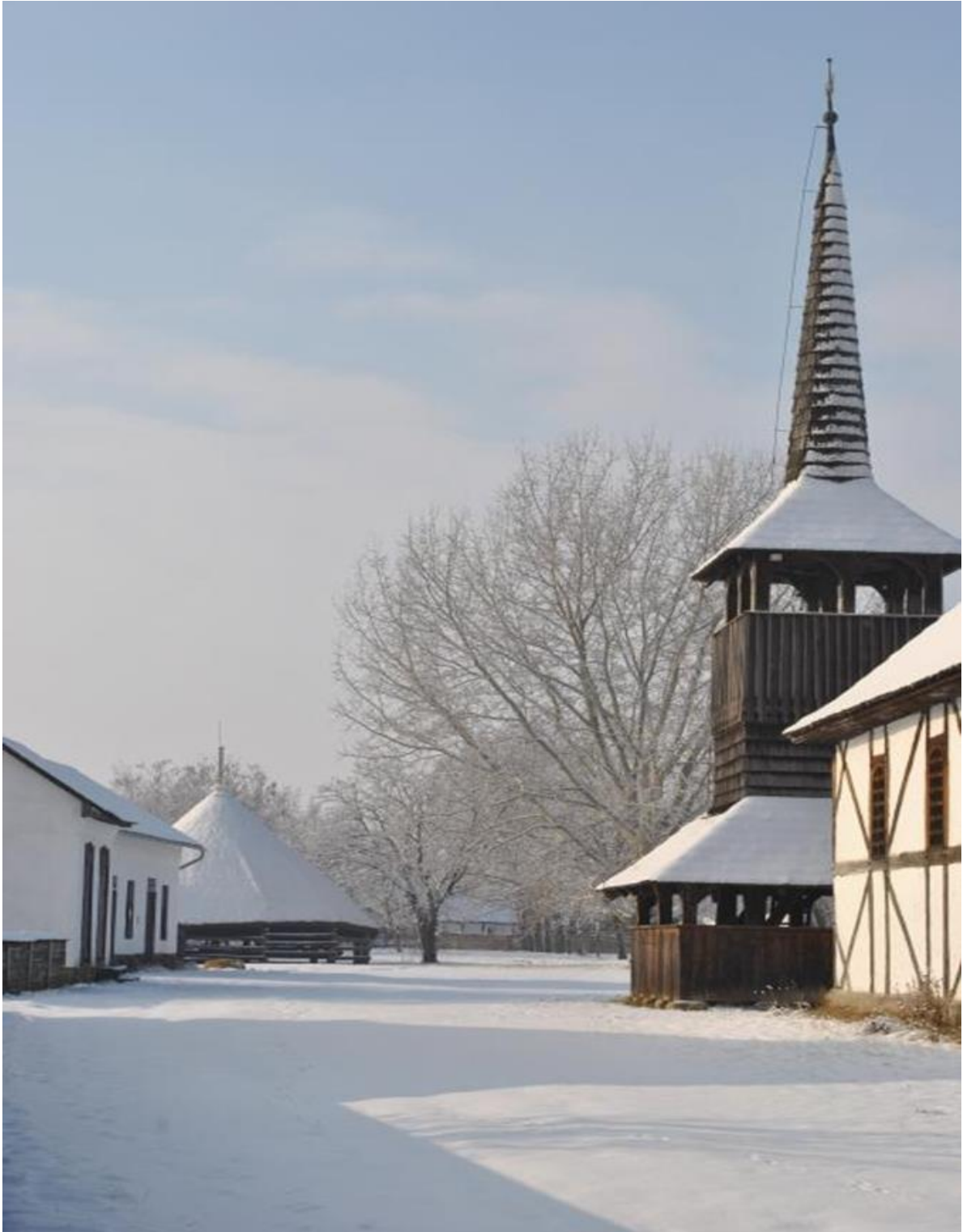
Sóstó Open Air Museum in the winter (Sóstó-Nyíregyháza)