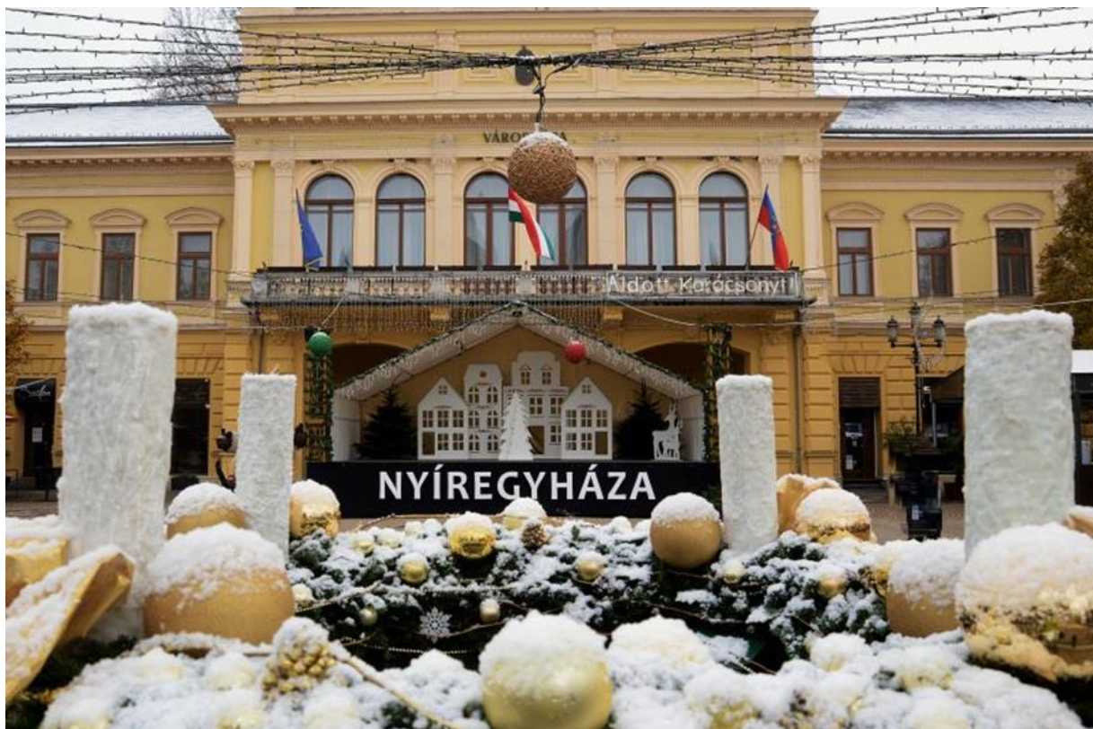
Advent wreath on the background of the City Hall- 2020 (Kossuth Square, Nyíregyháza)