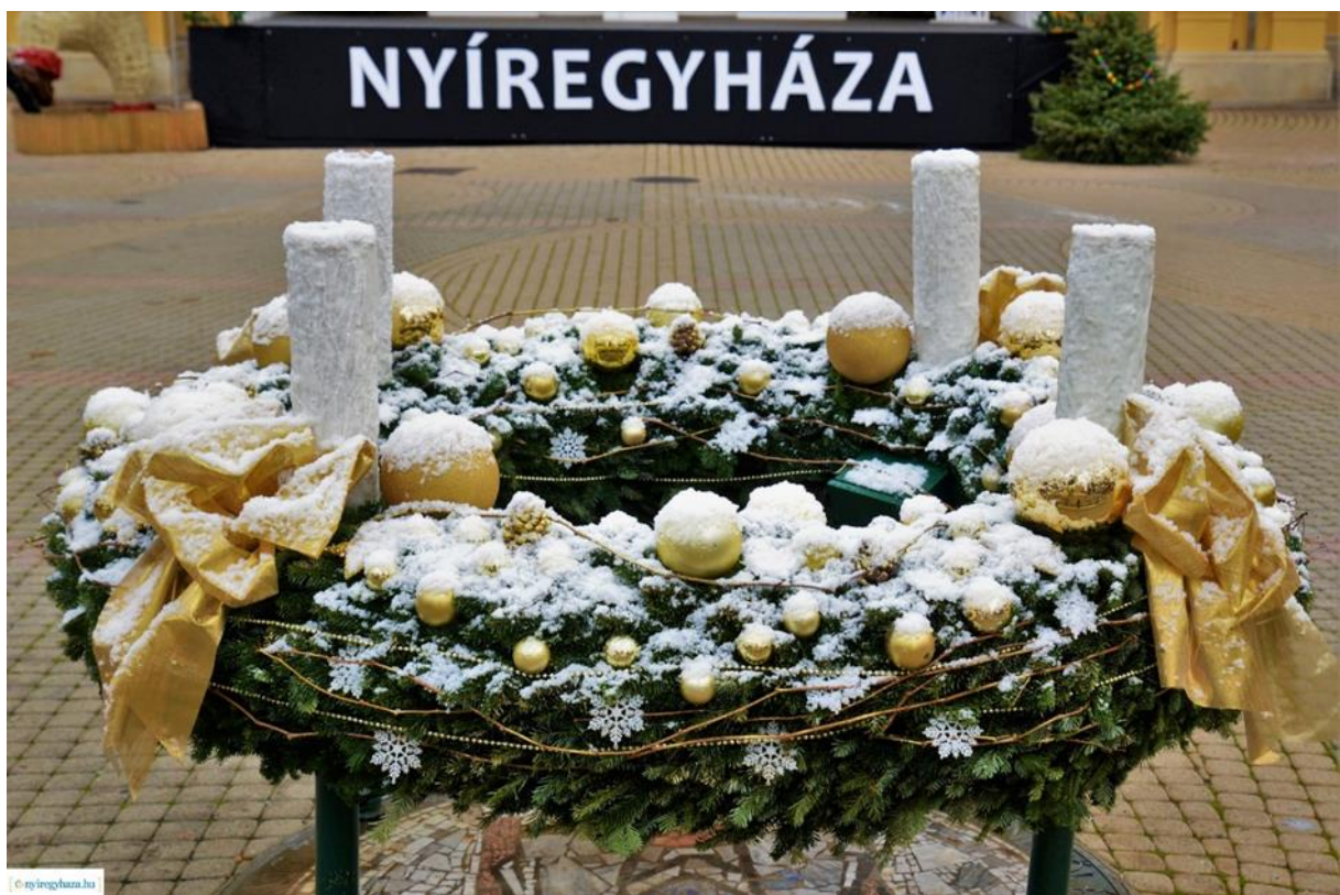
Advent wreath 2020 (Kossuth Square, Nyíregyháza)