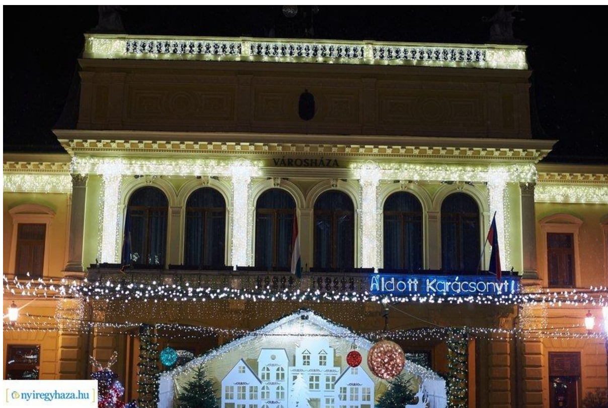
Christmas illumination, City Hall, 2020 (Kossuth Square, Nyíregyháza)