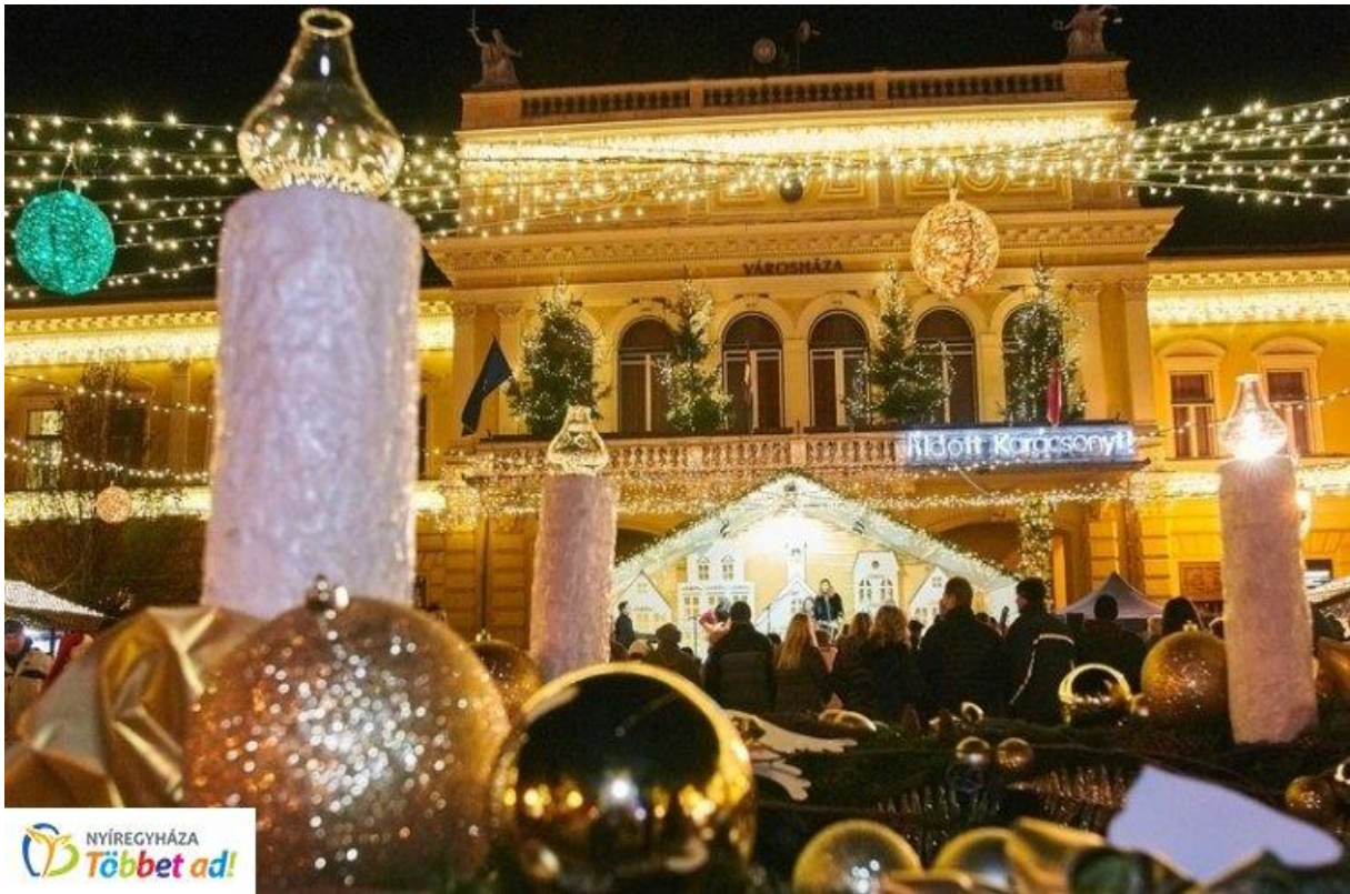
Festive lights (Kossuth Square, Nyíregyháza)