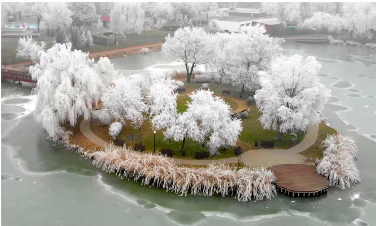
Sóstó in the winter