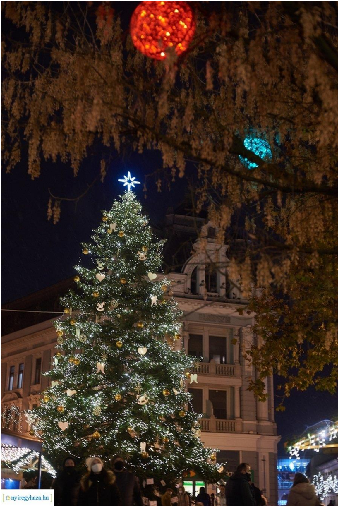
Christmas tree of the City (Kossuth Square, Nyíregyháza)