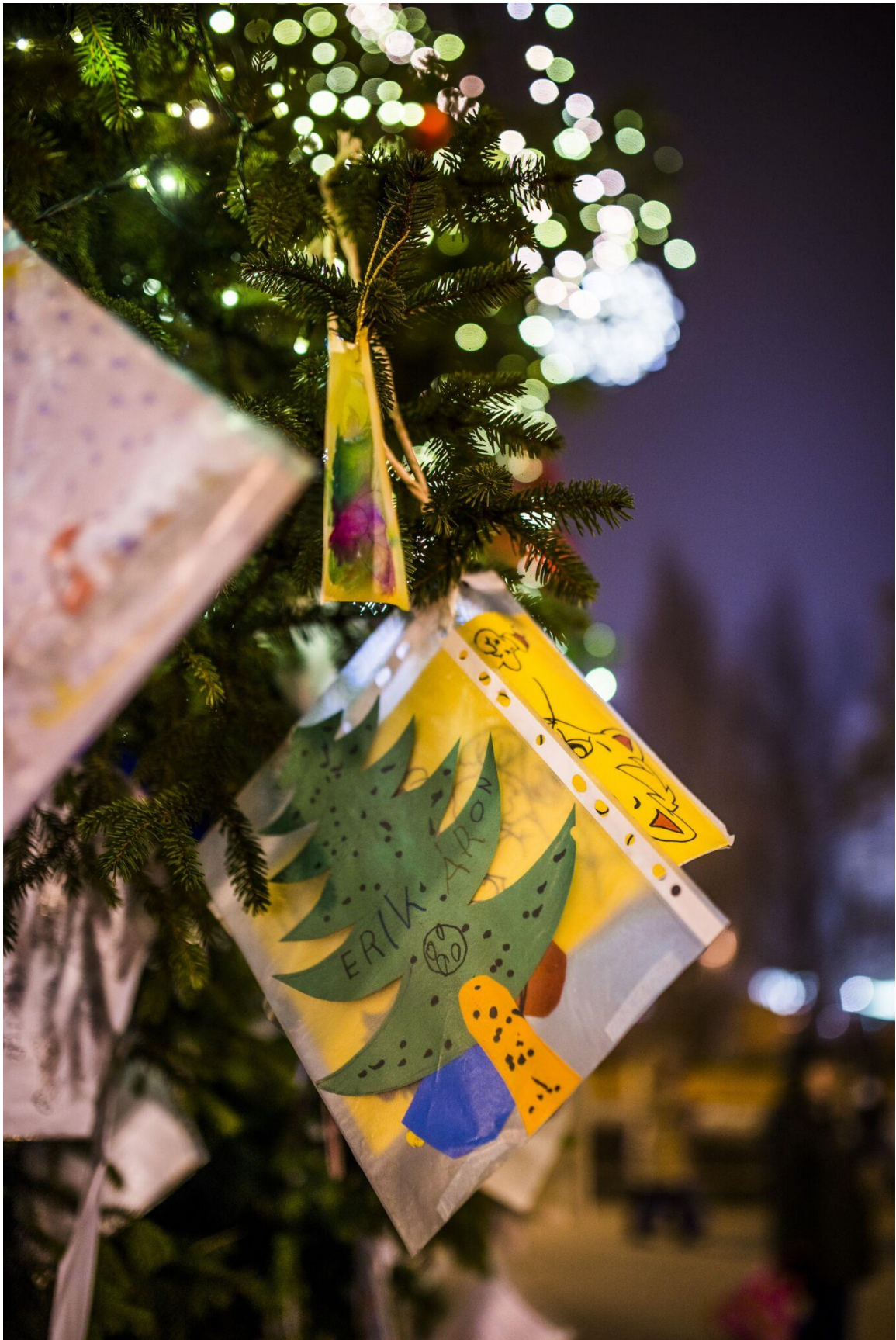
Christmas tree of the City – decorated with children's drawings