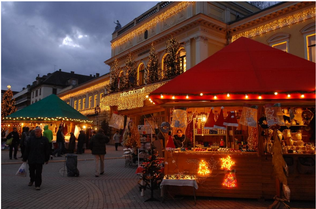
Advent Fair (Kossuth Square, Nyíregyháza)